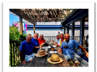
Breakfast at Jamestown