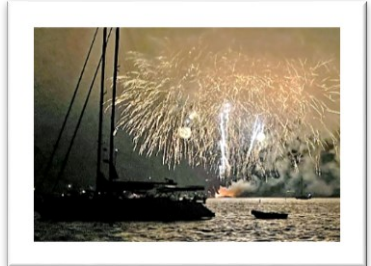
Bastille Day Fireworks