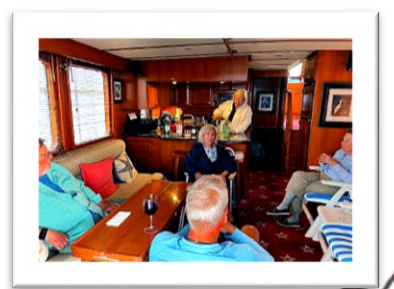
Aboard White Hawk